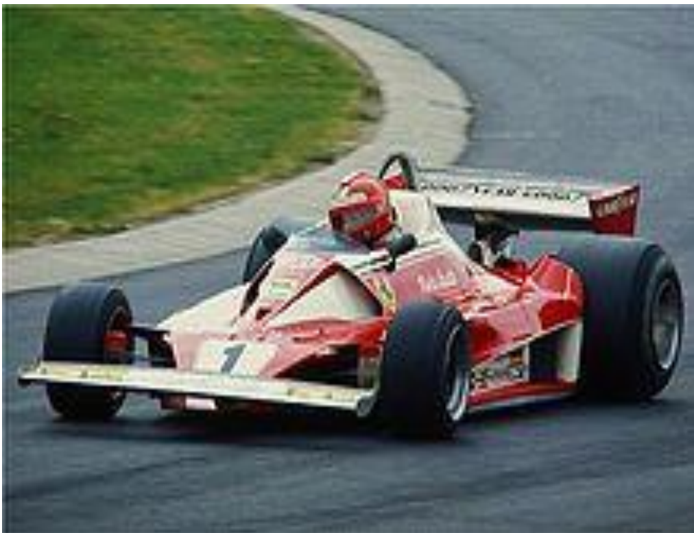
Fig. 3. Example of an image as it will appear at the electronic version of the Journal and a multi-line caption

Please check all figures in your paper both on screen and on a black-and-white hardcopy. When you check your paper on a black-and-white hardcopy, please ensure that the image used in each figure is clear and all text labels in each figure are legible.