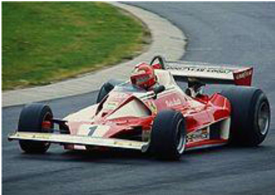
Fig. 3. Example of an image as it will appear at the electronic version of the journal and a multi-line caption