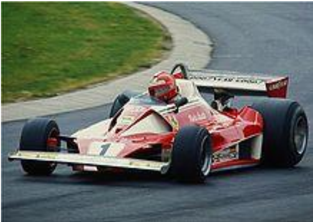
Fig. 3. Example of an image as it will appear at the electronic version of the Journal and a multi-line caption